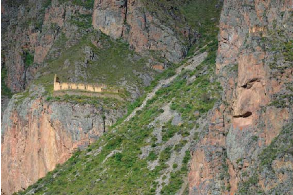
A picture from the Inca fortress at Ollantaytambo showing the effigy of Viracocha on the cliff at the right-hand side of this image.