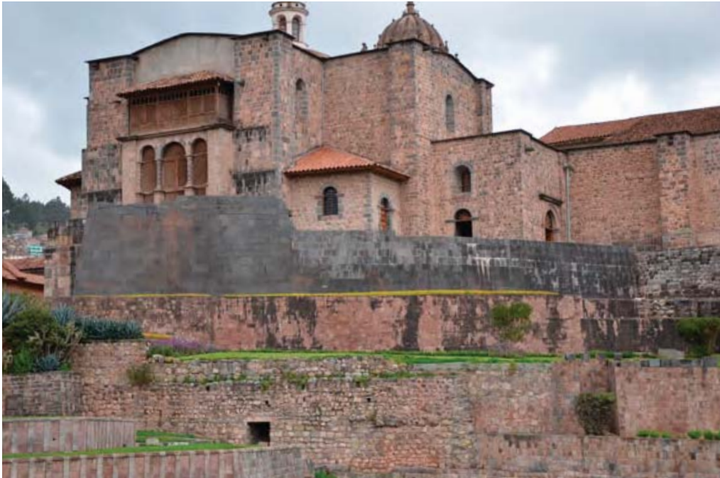
A picture of the Church and Convent of Santo Domingo showing the stone foundation of the Inca Temple of Coricancha beneath it.