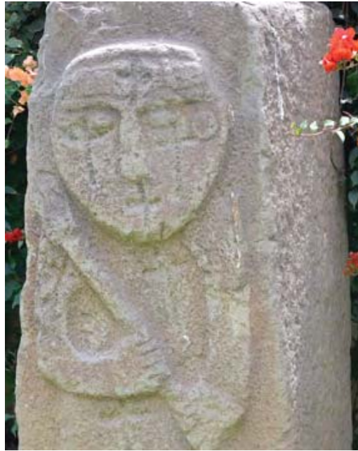
A statue of the “Weeping God” showing his scepter and tear tracks down his cheeks.

Garcilaso, whose account is not considered as reliable as those of the four primary cronistas , gives a rather different perspective than Cieza, who wrote this after viewing a statue of Viracocha: